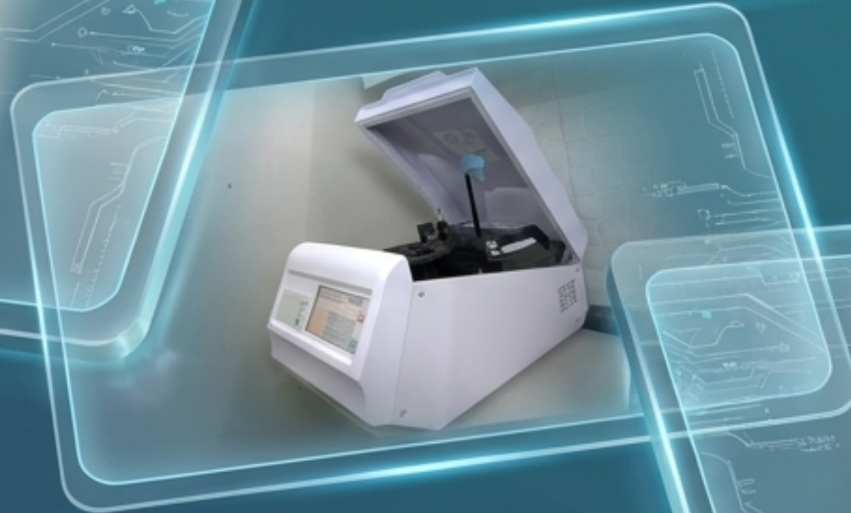
Automatic Chemistry Analyser: Automated measurement of blood, serum, plasma, and urine components.