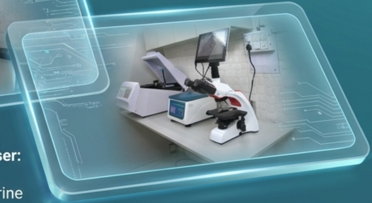
LCD Digital Microscope & Blood Centrifuge: For deep analysis of blood cell counts and feces.