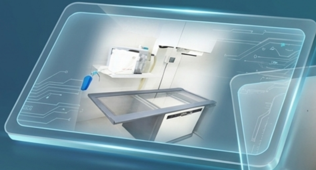
Digital X-Ray DR System with Gas Anaesthesia: For instantaneous musco-skeleton condition checks.

We no longer guess. Our in-house diagnostic suite provides immediate clarity on internal injuries, blood counts, and physiological fluids, saving critical hours.